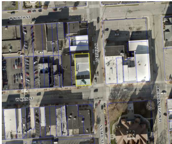
Aerial Site Location